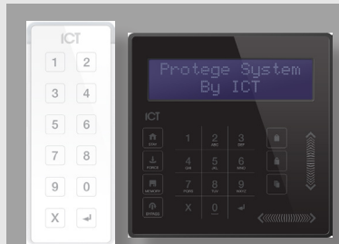
SCALABLE INTRUSION/ ACCESS PANELS